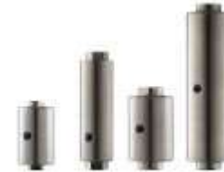
FAST LOOP FILTERS

Our standard Fast Loop filters are constructed from 316L stainless steel. A straight through flow design continuously flushes the filter element carrying the contaminants back out to the process stream, thus maximizing the filter element life. The low flow sample stream pulled into the analyzer is filtered to ranges of 200 micron to 0.5 micron (depending on the filtration efficiency required). Traditional T-type by-pass filters are detailed under Analyzer Filters.