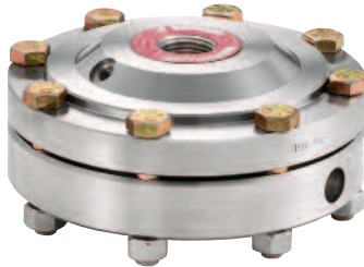
Type 741 – Threaded (w/flushing conn.) ¼, ½, ¾, 1 NPT