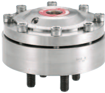
Type 702 – Low Pressure Flanged ½, ¾, 1, 1½, 2, 3 NPT