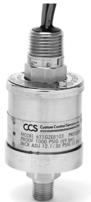
611GZE SHIPPING WT. APPROX. 22 OZ. (623 GRAMS)

NOTE: Unit can be set prior to installation. Insert 1/8" Allen wrench into adjustment screw (located in pressure port) and turn clockwise to decrease setting.