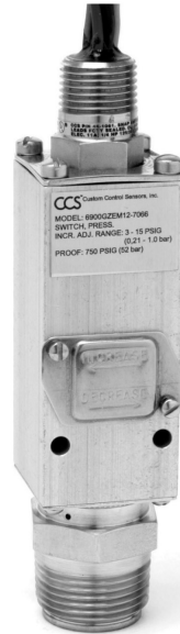
6900GZE-7066 SHIPPING WT. APPROX. 26 OZ. (737 GRAMS)